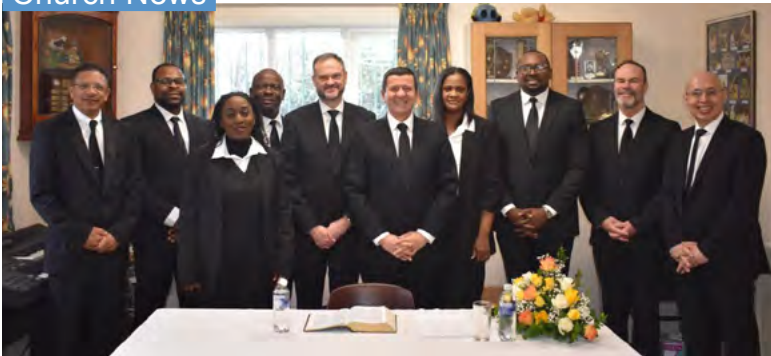
District Apostle Heynes visit to Sheffield 5 April 2026