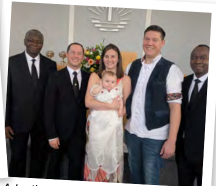
Adoption and Baptism in Corby