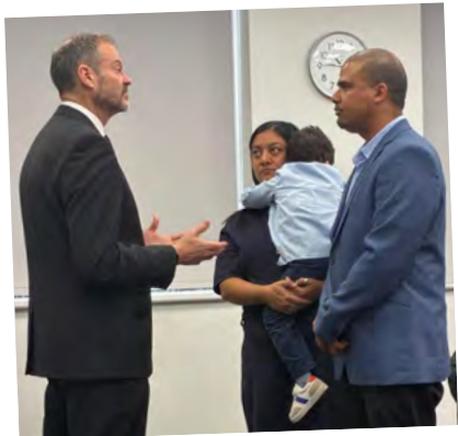
Holy Sealing in Eastleigh