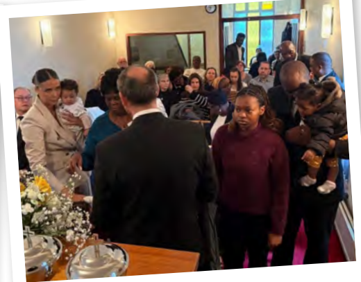
Holy Sealing in Gillingham