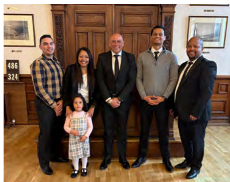
Palm Sunday Jersey congregation