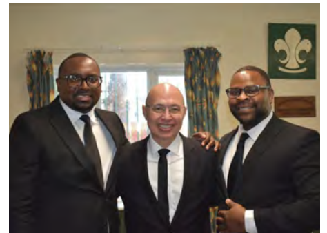
District rectors UK North District