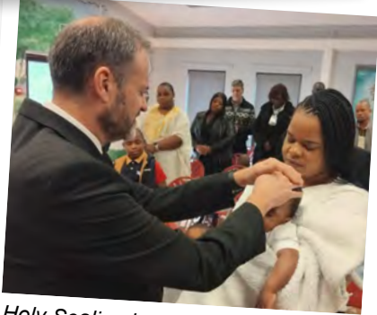
Holy Sealing in Norwich