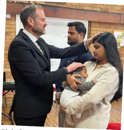
Holy Sealing in Luton