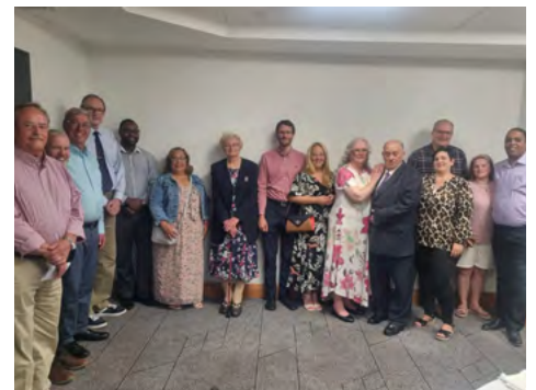
Ministers and wives retirement dinner