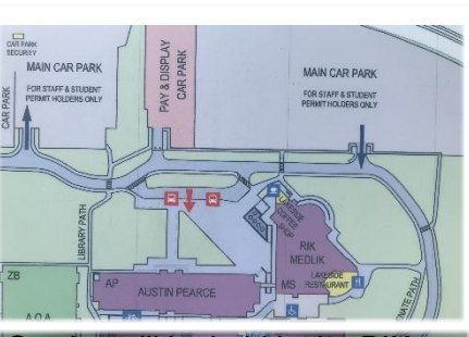
Service will be held in the RIK MEDLIK Building, just across the road from the free car park and on the same side of the Bus stop towards Guildford train station