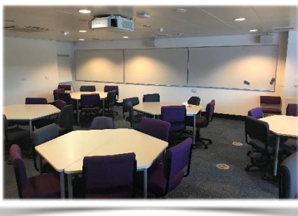
Mother and Child Room with projector