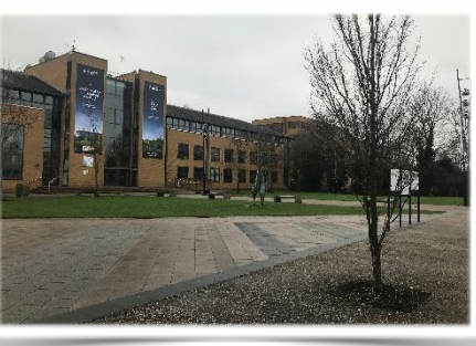
Central building for our service