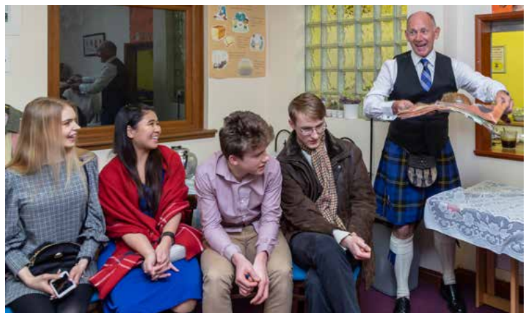
Fun and Fellowship