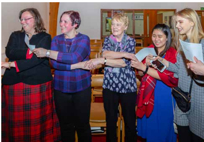
Auld Lang Syne