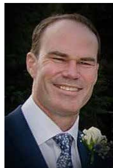
Evangelist Craig Esterhuizen